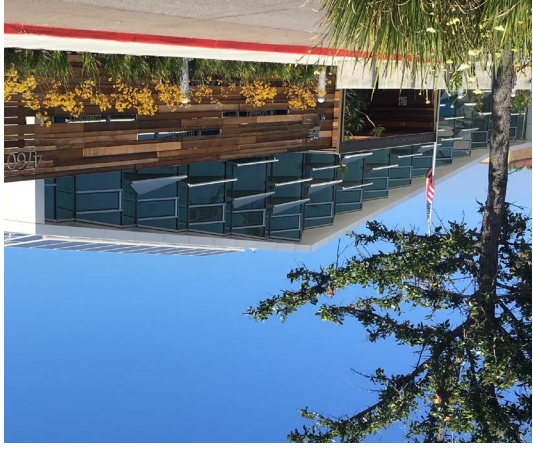
The SDGE Energy Innovation Center in Clairmont is a community resource that is part of the picture towards reducing energy to address climate change.