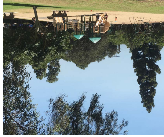
Parks are a critical component of our community's infrastructure and quality of life.