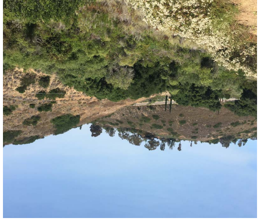
Preserving our open space areas is important to maintaining our community character and quality of life.